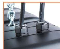
NEW HIGH-PERFORMANCE COMPOSITE CORD GRIPS